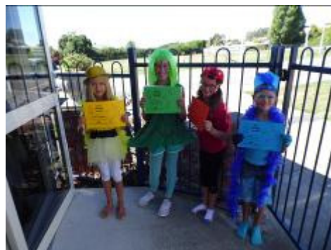
Last Year's Winners

We would appreciate if students could bring along a gold coin donation to help raise money for the Solomon Islands. We are learning about the Solomon Islands as part of our RE and Social Sciences studies this term.