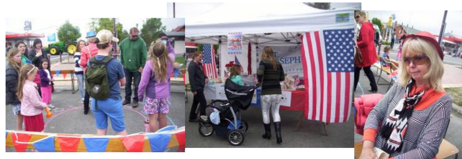
Get To The Point